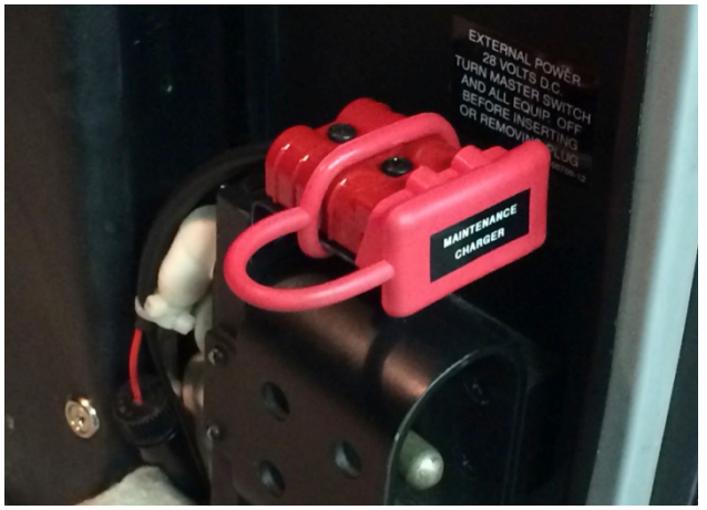
Charger harness wired to battery bus.